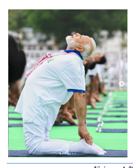
Kairos: A Journal of Critical Symposium